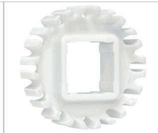
Sprockets Habasit Cleandrive™ HyCLEAN series