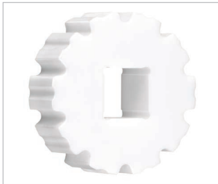
Sprockets Habasit Cleandrive™ series